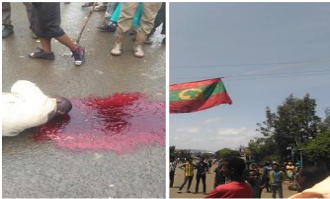
Sardaa.... Mogor West Shewa