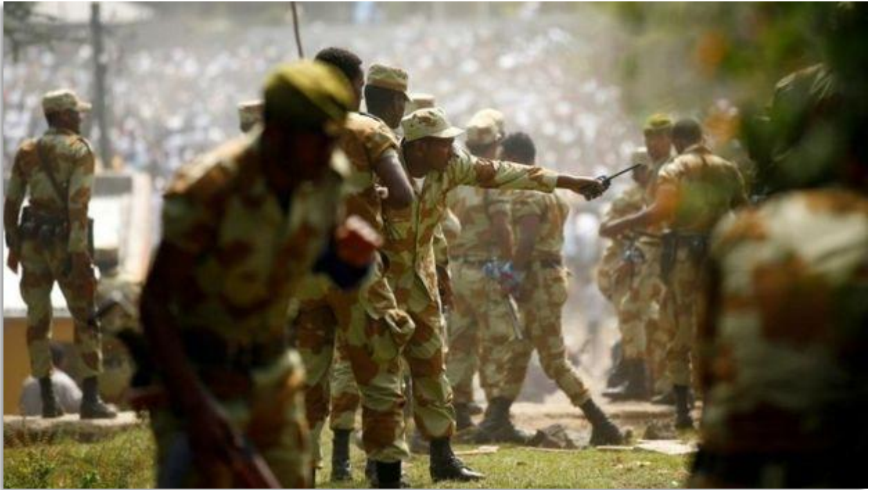
Security forces patrolling the streets during the state of emergency