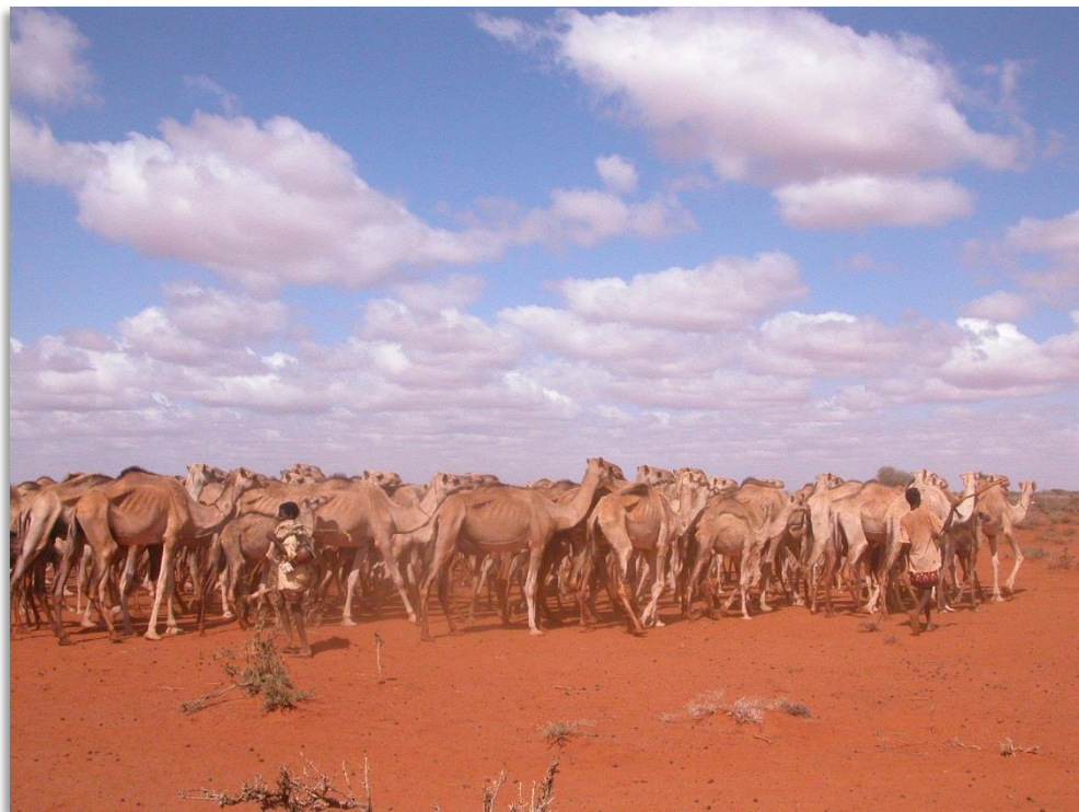
The Ogaden depend on pasturage for their livestock

For the Ogaden region, the auctioning of large swathes of land to multinational oil and natural gas companies is the severest problem related to detrimental business activities. Whole communities are being forced to move away from their traditional lands, without their consent or previous knowledge. Multinational companies are clearing thousands of square kilometres of pristine vegetation, making hundreds of crisscrossing roads in a precarious environment that is already prone to cyclical droughts. Around 70 percent of the Ogaden Somali people are agro-pastoralists and their livelihoods depend on the grasslands and forests that are now being recklessly destroyed. In addition, the Ethiopian army and proxy forces, such as the infamous Liyu police, cordon off large tracts of pastureland, watering wells and migratory routes of rural populations, and forcefully depopulate large areas, using targeted killings, rape and confiscation of livestock.