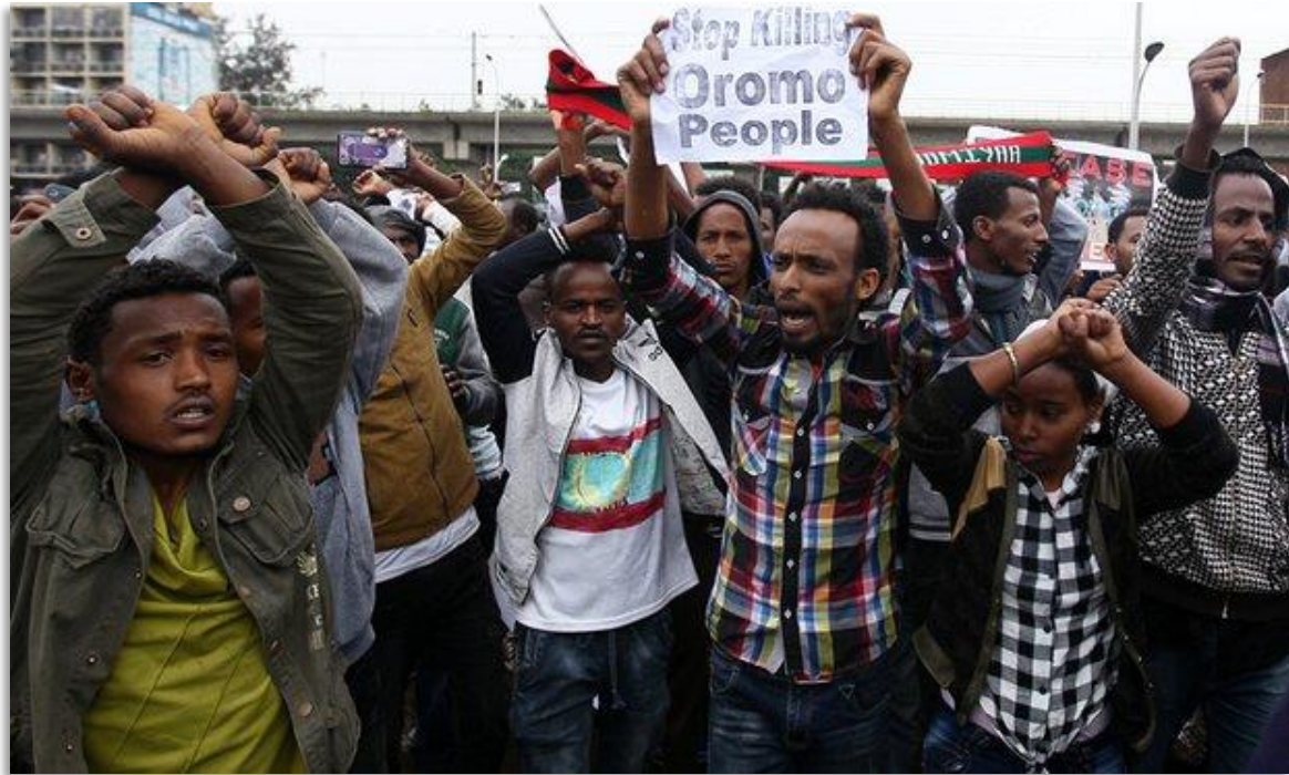
Oromo protesters chanting at a demonstration in Addis Ababa

so. In 2016, the Ethiopian government continued systematically harassing and imprisoning political opponents, human rights defenders, journalists and other members of civil society. Additionally, on 26 February 2016, the government informally removed Oromia's civilian administrators from office, replacing them with intelligence and military officers. Thus the government introduced de facto martial law to Oromia, which reached its culmination on 8 October 2016 when, following the Irrecha Massacre of over 600 Oromo 2 , an official state of emergency was established in the country.