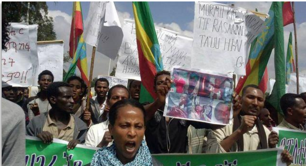
Oromo Protesters (May 2014)

civil society organizations decreased by more than half, or by almost 2,000 associations. 3 Besides the Anti-Terrorism Proclamation, this oppressive legislation is additionally being used by the state apparatus to curb civil and political activism by thusly illegalising any opposition to its hold on power. The CSO Law further stipulates that Ethiopian civil society organisations are not allowed to draw more than ten percent of their financial resources from foreign sponsors, affecting particularly the operations of those ethnic organizations with a large foreign diaspora, such as the ONLF and OLF.